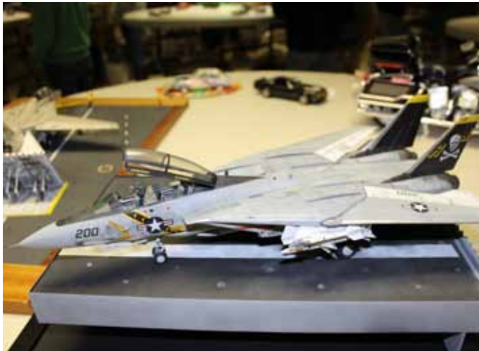
F-14 Tomcat, 1/48, by Rich Turner