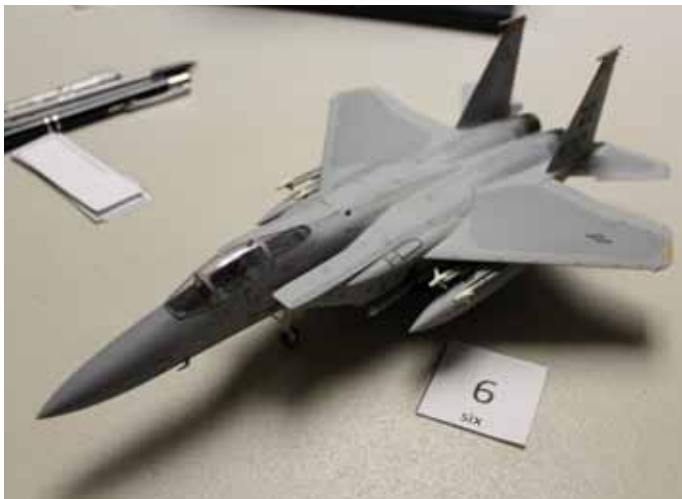
F-15 Eagle, 1/72, by Howard Rifkin