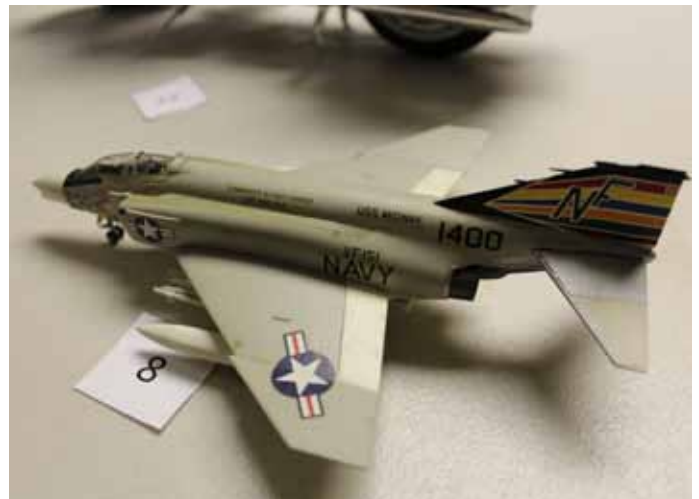
F-4 Phantom, 1/72, by Gary Schurr