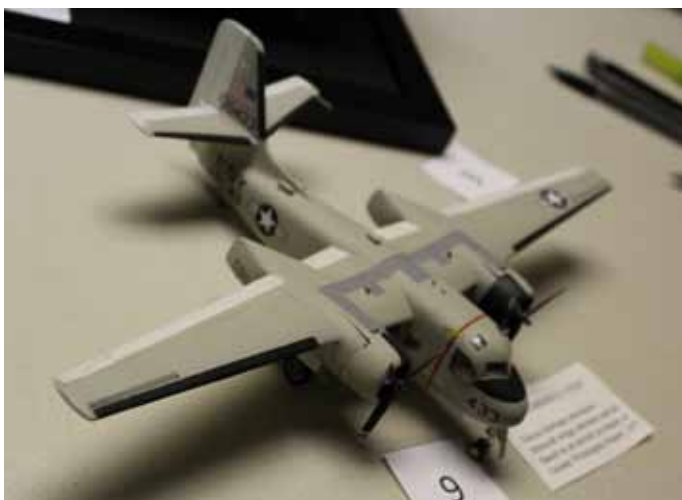
Grumman US-2, 1/72, by Joe Vattilana