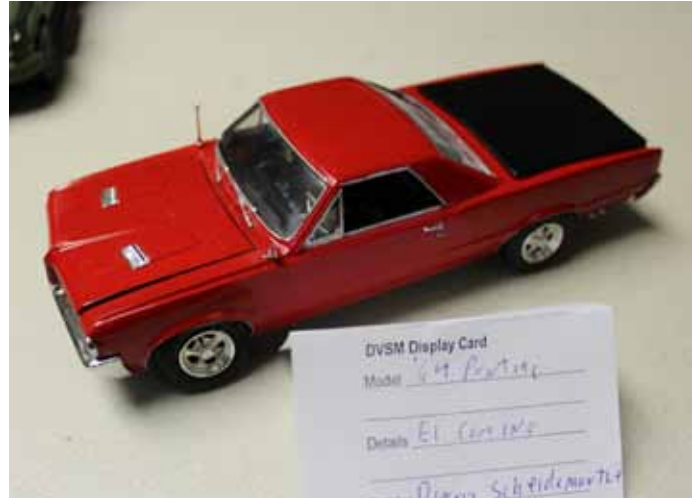
'64 Pontiac GTO pickup conversion, 1/24, by Bruce Sheidemantle