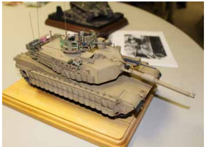
M1A2 Abrams, 1/35, by Lou Ursino