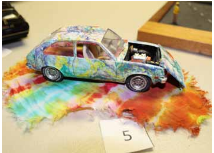
'77 Chevette, 1/25, by Rod Rakos