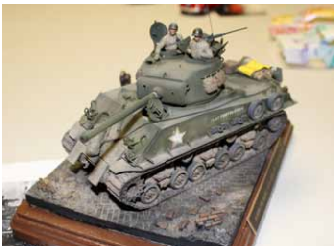
M4A3E8 Sherman, 1/35, by Lou Ursino