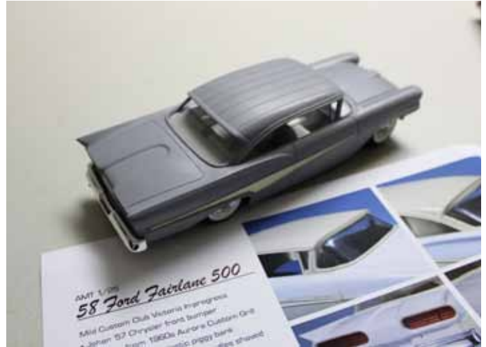
'58 Ford Fairlane 500, 1/25 (in progress), by John Goschke